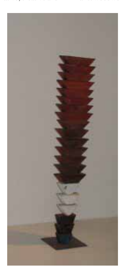
skills. It's easy, as the photo shows.

While visiting the Solomon R. Guggenheim Museum of Art in New York, I was struck by an epiphany. I, too, can be famous!!! More than that, I can be recognized by the world at large, for my honest, imaginative, creative and minimalist woodworking