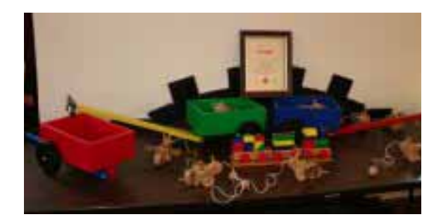
Beautiful Toys for Tots

the final day of the November 8th and 9th, 2008 LaConner pre-Christmas festival when hundreds of shoppers were no-shows at that town's biggest annual event.