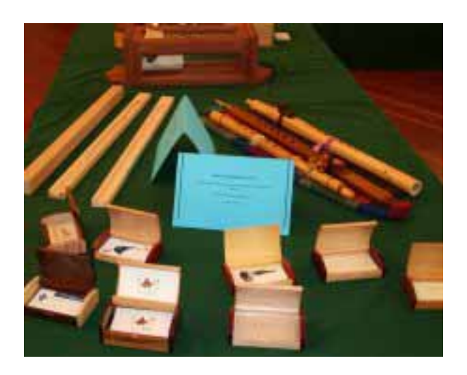
Boxes and Native American Flutes

Across the aisle, the Woodturners had a more distinct presentation on their tables this year. Instead of loading