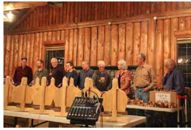
Val's Toy Shop Crew