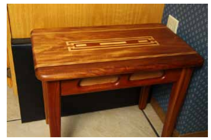
End Table by Larry Tomovick December Presenter