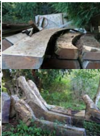
Firewood or Boatwood?