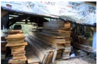
Alaska Yellow Cedar, Fir