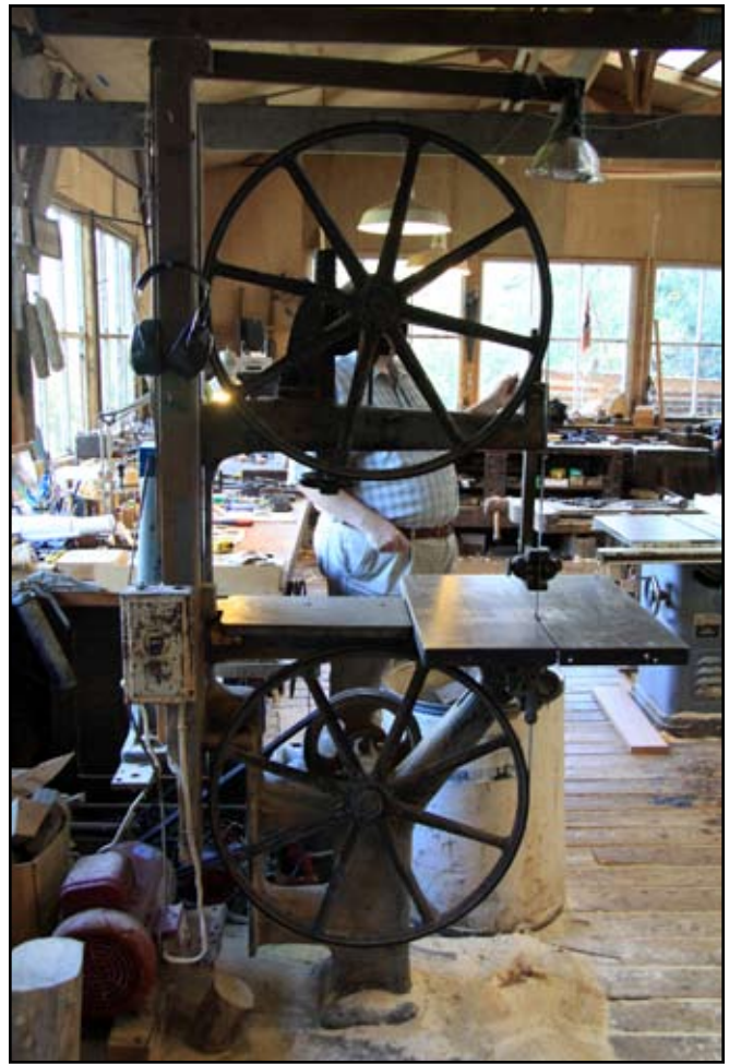
Big Timbers, Big Bandsaws