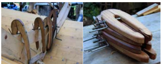
Low Cost Big Clamps