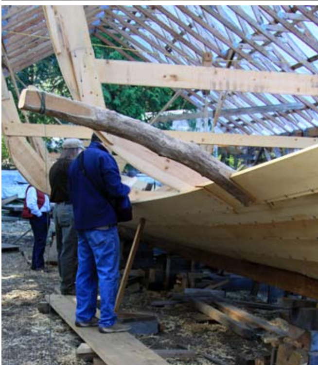
Yew wood "persuader", torturing the plank into a scarf joint