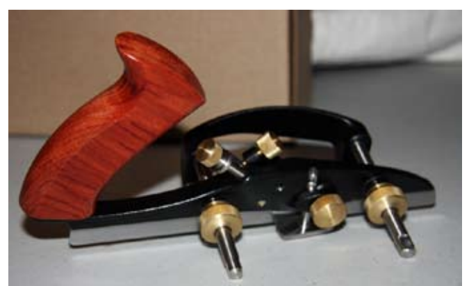
What a Great Christmas!