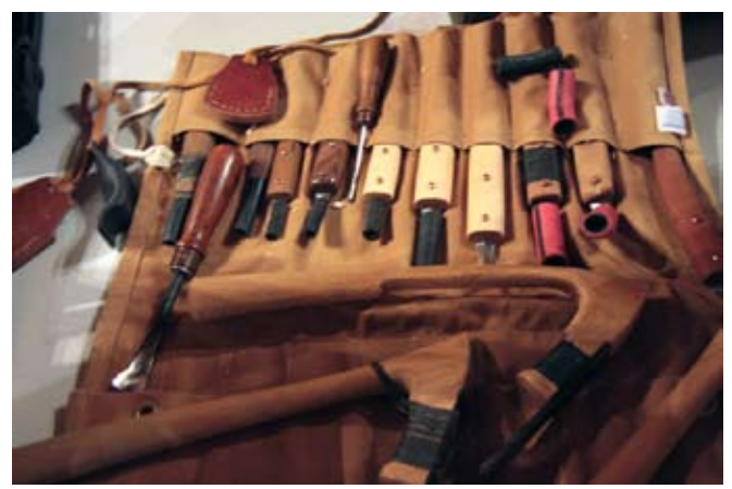
Tool Roll with Gouges, Crooked Knives and Several Adze