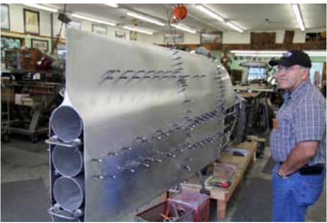
From the Stern

thing else to do Jim welds fuel tanks for funny car dragsters all over the country.