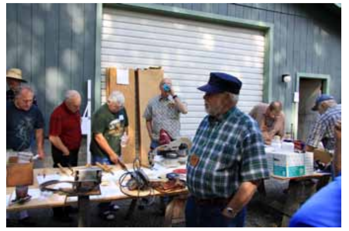
Looking for Treasure at the Auction

higher bid on the next line. Normally, bids should advance by at least 10% over the previous bid. Check back often to see if you are still the highest bidder. When the cutoff time is announced, the highest bidder wins the item provided their bid exceeds the stated minimum bid. The bidder then pays the seller, so don't forget to bring money or your checkbook! You never know what might show up for sale! Please make copies of the attached silent auction form for any items you bring to sell.