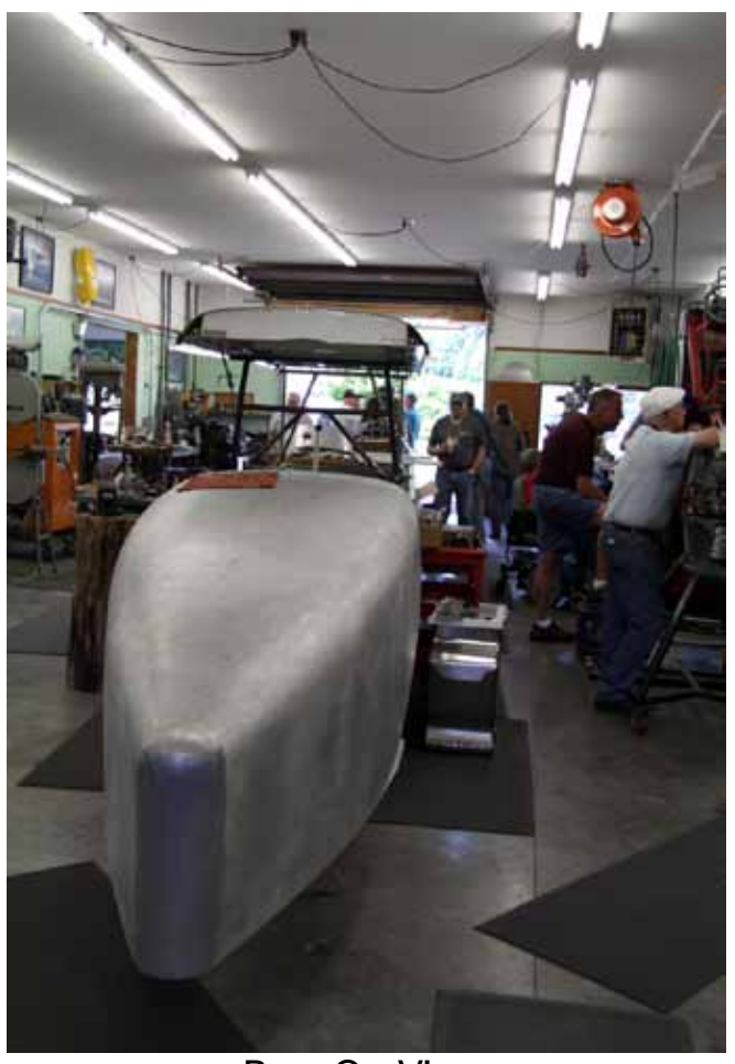
Bow On View

Oh, and by the way, what about the car? The 45 foot long, 7,000 pound land speed record holder to be with a turning radius from here to Monterey? Oh, that car..