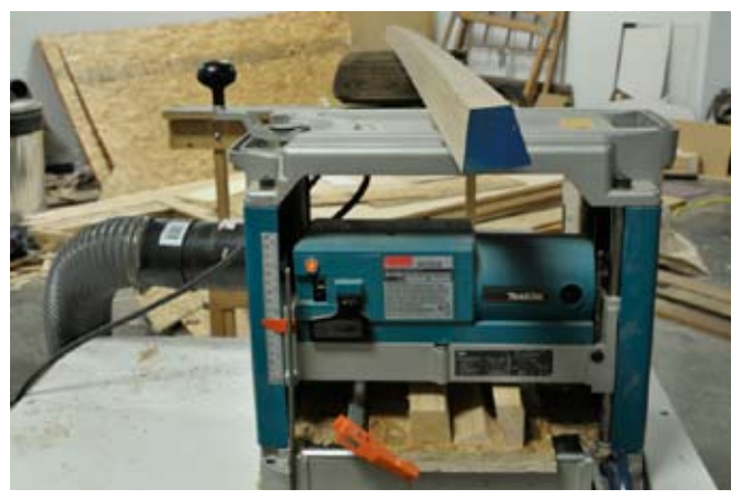
Guide and Finished Piece