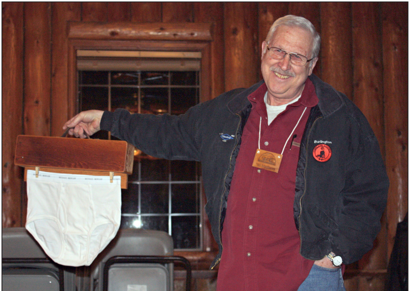
Norwegian Briefcase by Val Matthews

Take Highway 20 into Anacortes. Stay on Commerical to 11th (Callico Cupboard on right). Turn right. Go to R avenue. Turn left. Follow R avenue around the north end of Cap Sante marina. The road turns into 7th Street. The yacht club is on your left, two story building. It's the last building on 7th Street. We are on the top floor.